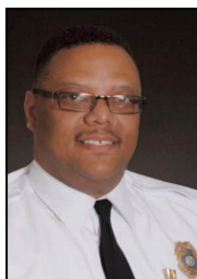
Aldred Days Lieutenant Training