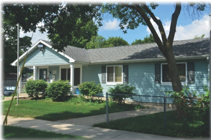
William Wadewitz Community Oriented Policing House 1750 Mead Street