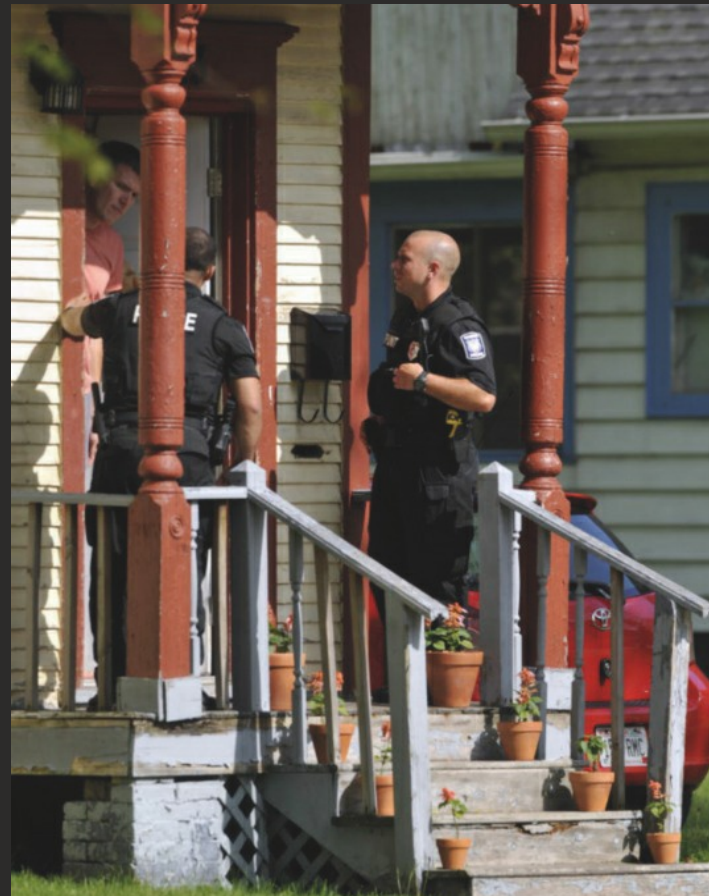
Joint efforts by all jurisdictions made the day a success