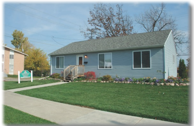
2437 Jacato Drive Community Oriented Policing House