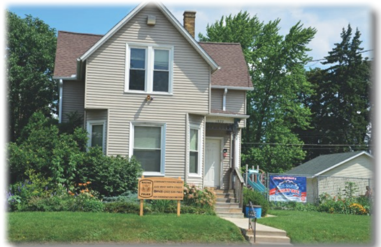
West Sixth Street Community Oriented Policing House 1522 West Sixth Street