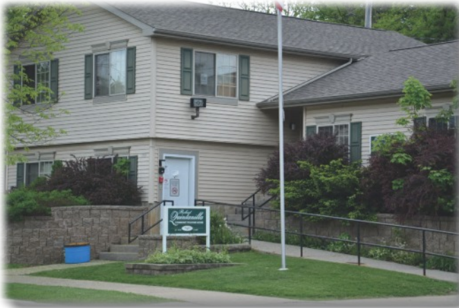
Robert Quintanilla Community Oriented Policing House 1140 Geneva Street