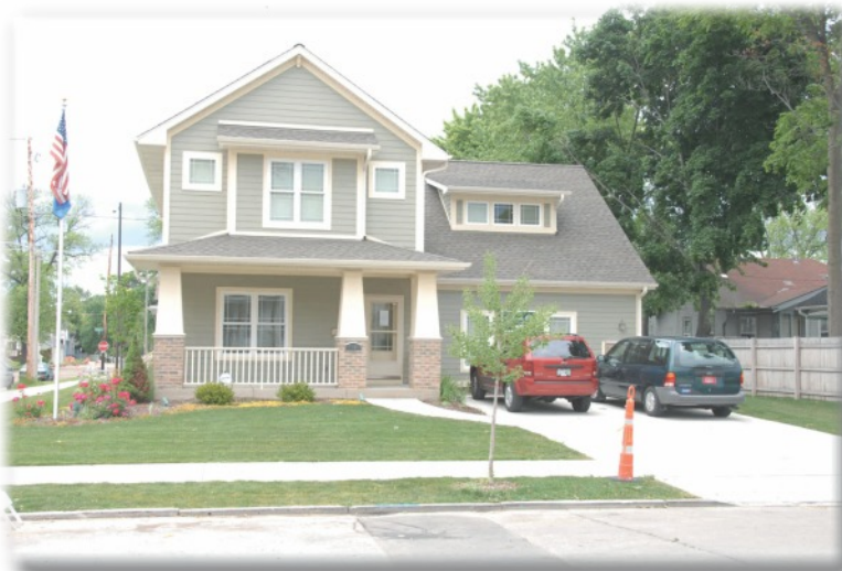
Thelma Orr Community Oriented Policing House 1146 Villa Street