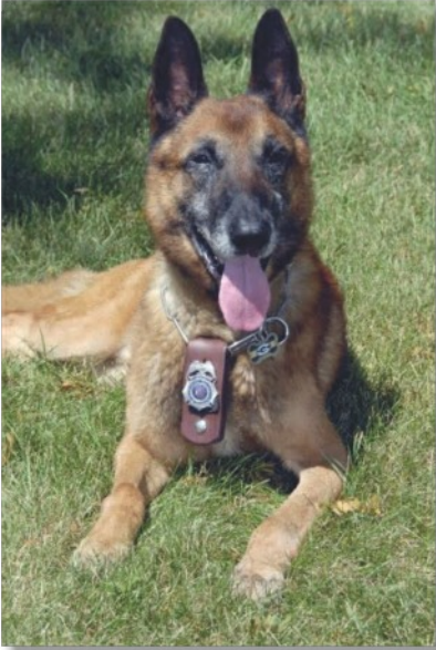
Tour of Duty: January 1, 2006 - July 3, 2014