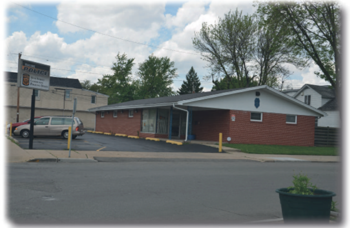
Richard V. Polzin Community Oriented Policing Office 1900 16 th Street