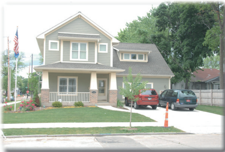
Thelma Orr Community Oriented Policing House 1146 Villa Street