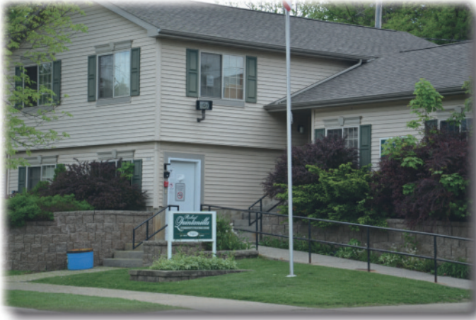
Robert Quintanilla Community Oriented Policing House 1140 Geneva Street