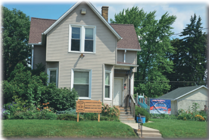
West Sixth Street Community Oriented Policing House 1522 West Sixth Street