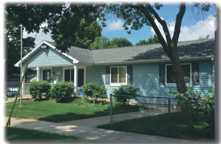
William Wadewitz Community Oriented Policing House 1750 Mead Street